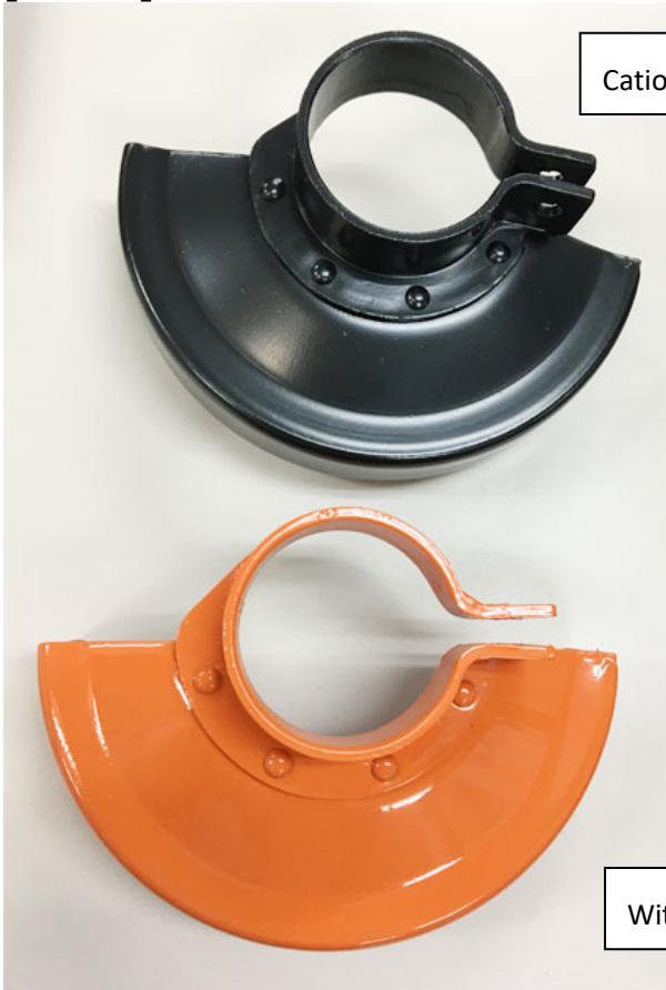
Cationic coating (black color)